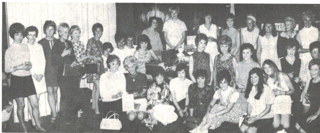
'RESENTATION NIGHT WITH THE STERLING LADIES AT WEMBLEY